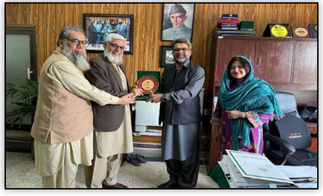
DG QAA presenting shield to Chairperson NAEAC

The financial situation was also improved and human resource was increased from 4 to 7 personnels. He introduced the culture of Corporate Social Responsibility by providing different insurance packages to NAEAC employees. Other accomplishments included upgradation of NAEAC website and issuance of Accreditation Certifiates for accrediated programs. Another landmark contribution is initiation of Agriculture Personnel Registration System (APRS) for registration of agriculture and allied sciences graduates/professionals/fellows and adoption of paperless accreditation system through indigenously developed Agriculture Accreditation Automation System (AAAS). With consistant efforts and under the guidance of Council board members he created an endowment fund for strong and sustainable NAEAC activities. Last but not least evaluation manual (toolkit) was revised in such a manner that each sub criteria were specific, measurable, achievable, relevant and time (SMART) bound to uplift the academic standards in HEIs.