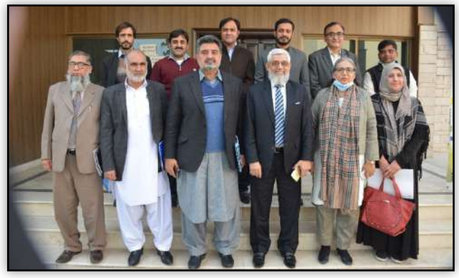
16th Council Meeting of NAEAC (2020)