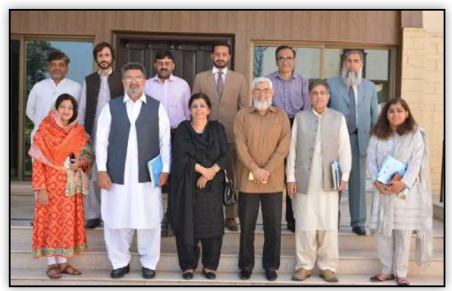
18th Council Meeting of NAEAC (2022)